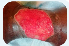
7 days of MedCu application

After seven days of applying the MedCu copper oxide dressings, dramatic improvement was seen. A followup bacterial culture was found to be negative, and there was a drastic reduction in edema and intense granulation tissue formation.