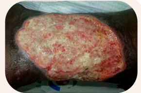
2 days of MedCu application

Immediately after arriving at the clinic, RL underwent conservative desloughing and wound bed preparation. The wound was then covered with MedCu copper dressings, which were changed every two to three days. Within two days of the initial application of the MedCu dressing, improvement was already evident.